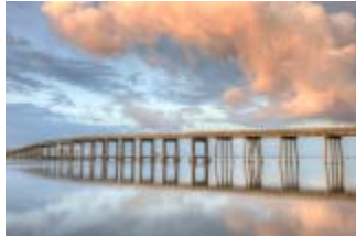
Sunrise Bridge 4784