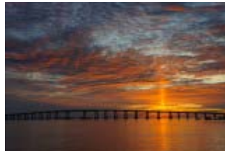
Bridge Sunset 7564