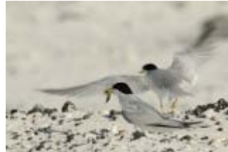
Least Turn Nest 6080