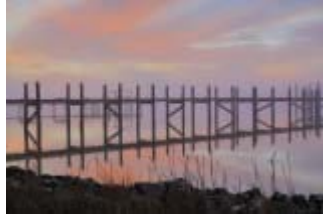
Sound Sunrise 5891