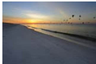
Beach Sunrise 9443