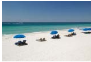
Blue Umbrellas 3224