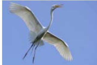
Great White Egret 1874