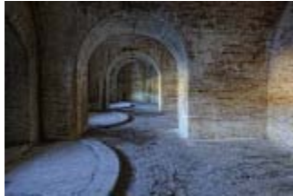
Fort Pickens 8486