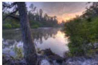
Blackwater River 9830