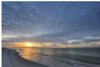
Beach Sunrise 9859