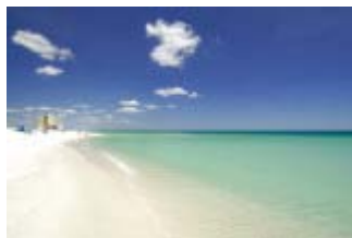
Calm Surf 3418