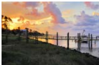
Sound Sunrise 4491