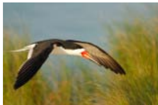
Black Skimmer 1749