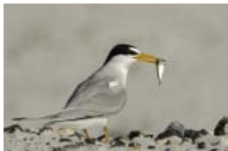
Least Tern 6094