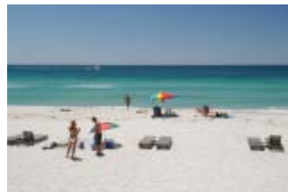
Fun N Sun 3211