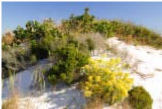
Beach Flora 4512