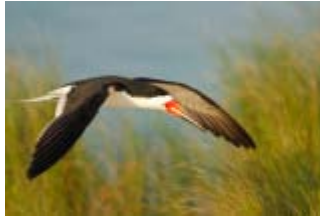
Black Skimmer 1749