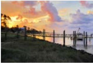
Sound Sunrise 4491