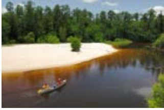
Blackwater River 4161