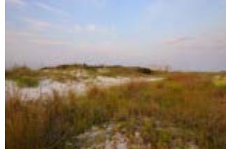
Beach Morning 0152