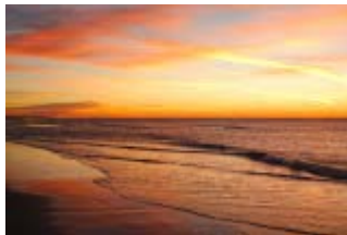
Cross Sunrise 5879