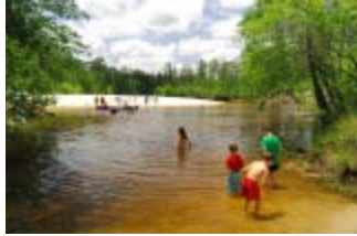
Blackwater River 4216