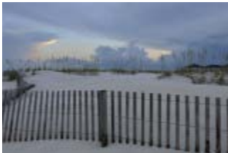
Opal Beach 1139