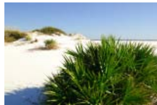
Beach Flora 4518