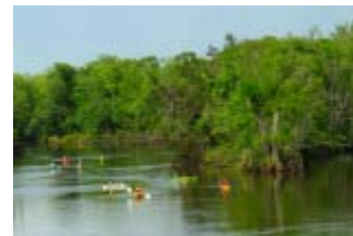
Yellow River 0614