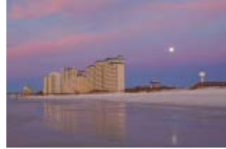
Sunrise & Moonset 1727