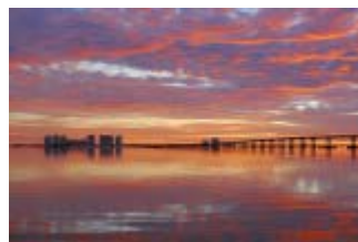
Skyline Sunset 0404