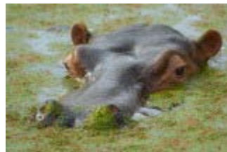
Zoo - Hippo 0039