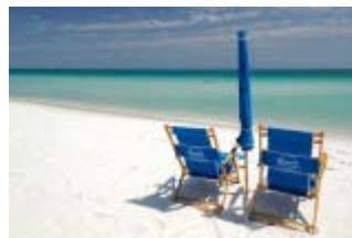
Beach Umbrella 5470