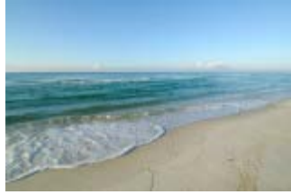
Beach Morning 3310