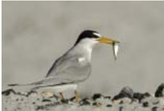
Least Tern 6094