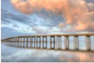
Sunrise Bridge 4784