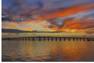
Bridge Sunset 1892