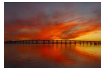
Bridge Sunset 0781