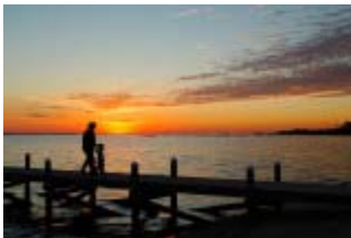
Sound Sunset 7244