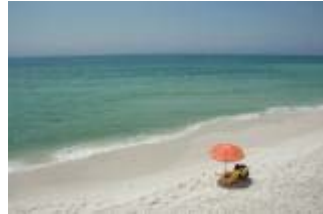
Beach Privacy 8970