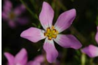
Marsh Pink 0958