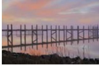
Sound Sunrise 5891