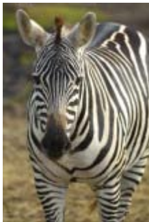
Zoo - Zebra 9664