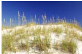
Sea Oats Dune 4491